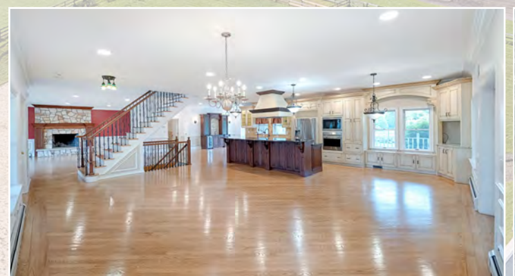
Perfect for Entertaining