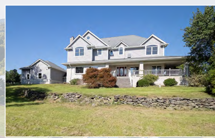
Custom Main House

367 Union Valley Rd, Newfoundland, Passaic Co, NJ 07435