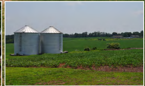
Plant your Crops! Bring your Livestock!