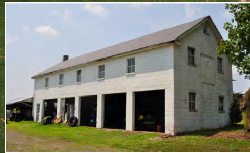
Equipment Barn with Second Floor Storage