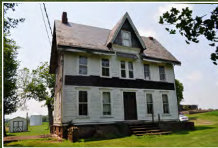
Ready for Restoration