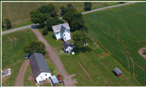
Farmstead on country road

1663 Little York Mt Pleasant Rd (CR-519), Alexandria Twp (Pittstown), Hunterdon County, NJ 08867