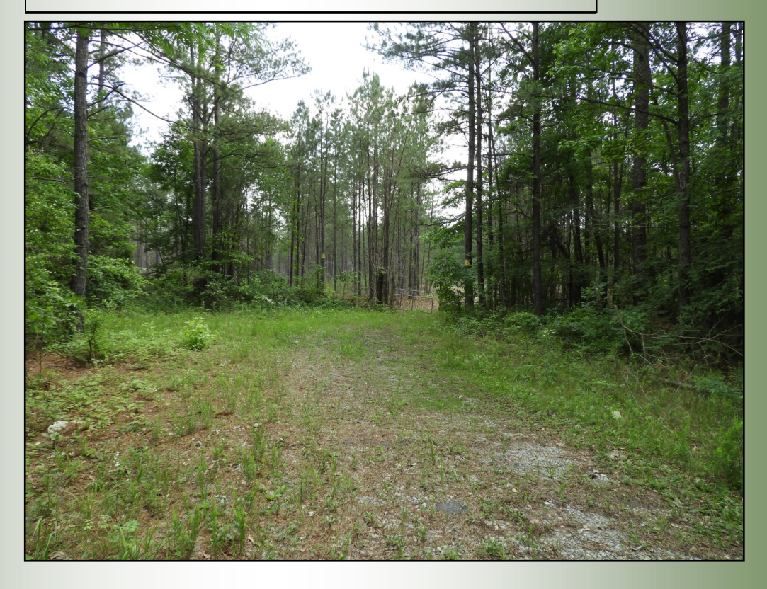
27.33 Acres | Mays Bridge Road | Floyd County, GA | 30165